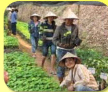
Biomass & Biofuel