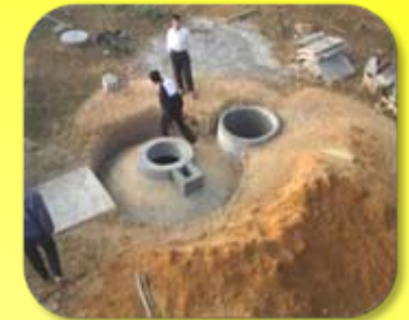
Waste Water & Biogas